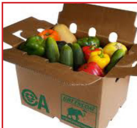
Wax coated cardboard.