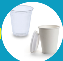
PLASTIC OR PAPER CUPS