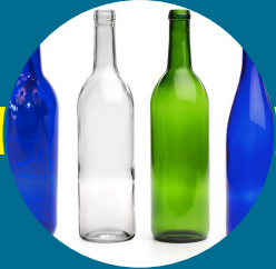
GLASS BOTTLES & JARS Blue, Green & Clear Glass Rinse/remove caps