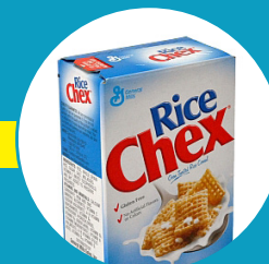
PAPERBOARD Like cereal boxes & 6 pack containers