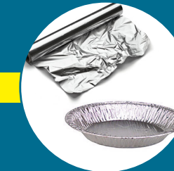
ALUMINUM FOIL & PIE PLATES