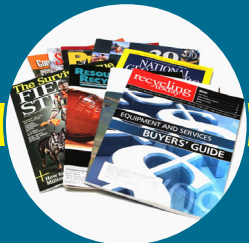
MAGAZINES & CATALOGS