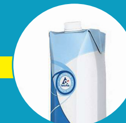
TETRAPAK Tetrapak containers