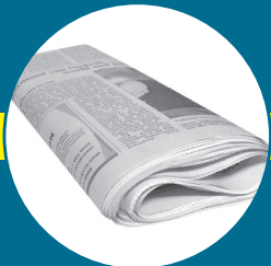
NEWSPAPER & INSERTS