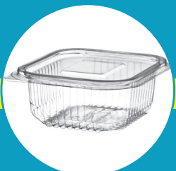
PLASTIC FOOD CONTAINERS Like yogurt cups & clam shells