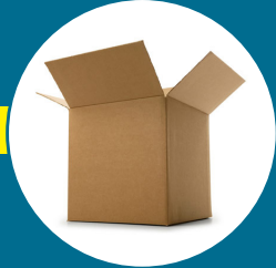
CORRUGATED CARDBOARD Boxes (w/ridges) & Brown paper bags