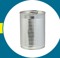
STEEL FOOD CANS