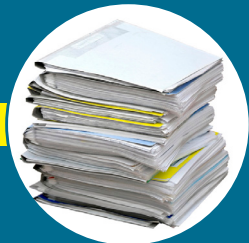
OFFICE PAPER Includes a wide range of papers