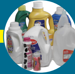
#2 PLASTIC BOTTLES Rinse, remove caps