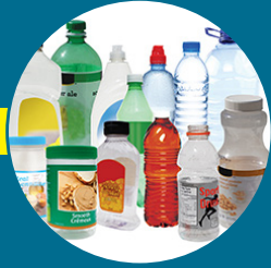
#1 PLASTIC BOTTLES Rinse, remove caps