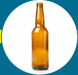
GLASS BOTTLES & JARS Brown Glass Rinse/remove caps