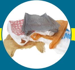
PLASTIC WRAP & GROCERY BAGS